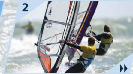
2 People come here to fish, sail, surf, walk, cycle, enjoy the wildlife, and simply to relax.