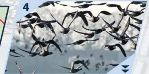
4 Our saltmarshes and mudflats are protected as internationally important areas for the conservation of wild birds, such as this flock of Brent Geese.