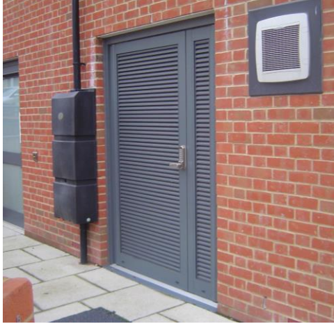
Photo 3. Example of good practice - bin store lock. The picture below shows a bin store fitted with a digital lock.