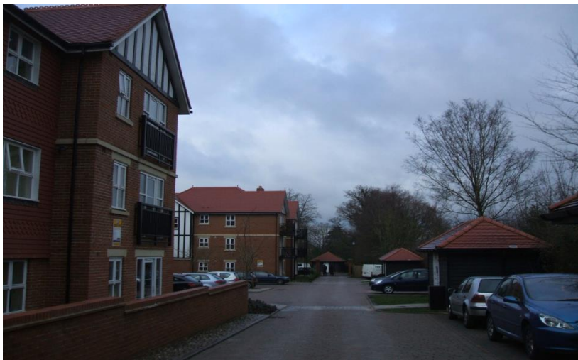
Photo 2: Example of good practice - bin storage A further example of good practice where the bin store is included in the main building but is at ground level. The store is close to the road so is accessible to the collection crew at all times and is not affected by parked vehicles. The refuse freighter can access the bin store without the need to reverse into the development.

Photo 1: Example of good practice - bin storage – The picture below shows a development that has a number of bin stores located in strategic locations that are accessible to residents and collection crews at all times. The store is secure and the bins hidden from view.