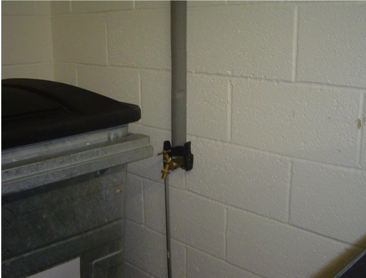
Photo 6: Example of bad practice, unprotected services within a bin store – The pictures below shows a number of unprotected taps and switches within a bin store. These should be positioned either above bin height or protected from possible mechanical damage.