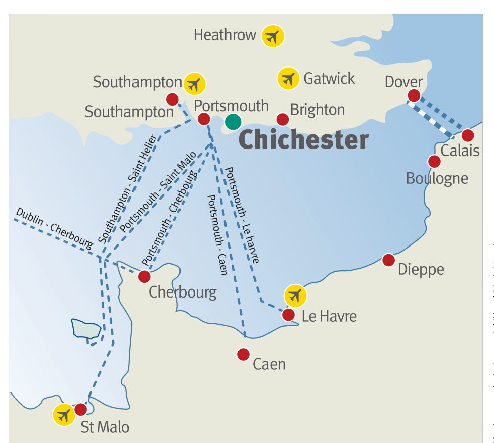
*Copying or reproduction in part or in full is prohibited w prior written consent of Burrows Communications Ltd. All rights reserved Burrows Communications Ltd 2018.