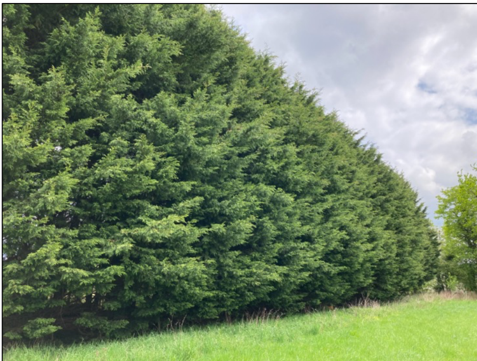
Photograph 3. Coniferous plantation woodland

There is a small strip of coniferous plantation woodland along the eastern boundary of the site. This consisted of Leyland cypress Cupressus x leylandii , with a sparse understory of ivy.