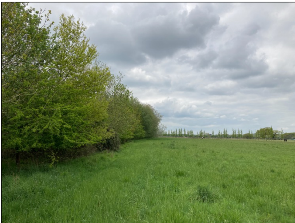
Photograph 5. Scattered trees

Scattered semi-mature trees are present along the western boundary of the site and across the centre of the site along the banks of the ditch. Species present included alder, ash, hawthorn and Prunus sp. A row of poplar Populus sp. saplings are present along the northern boundary.