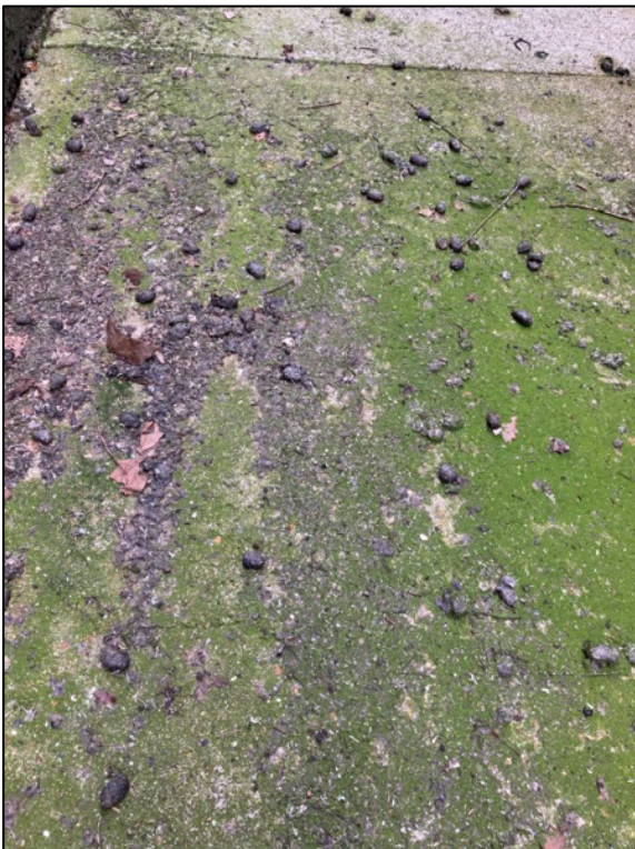
Photograph 8. Barn owl pellets