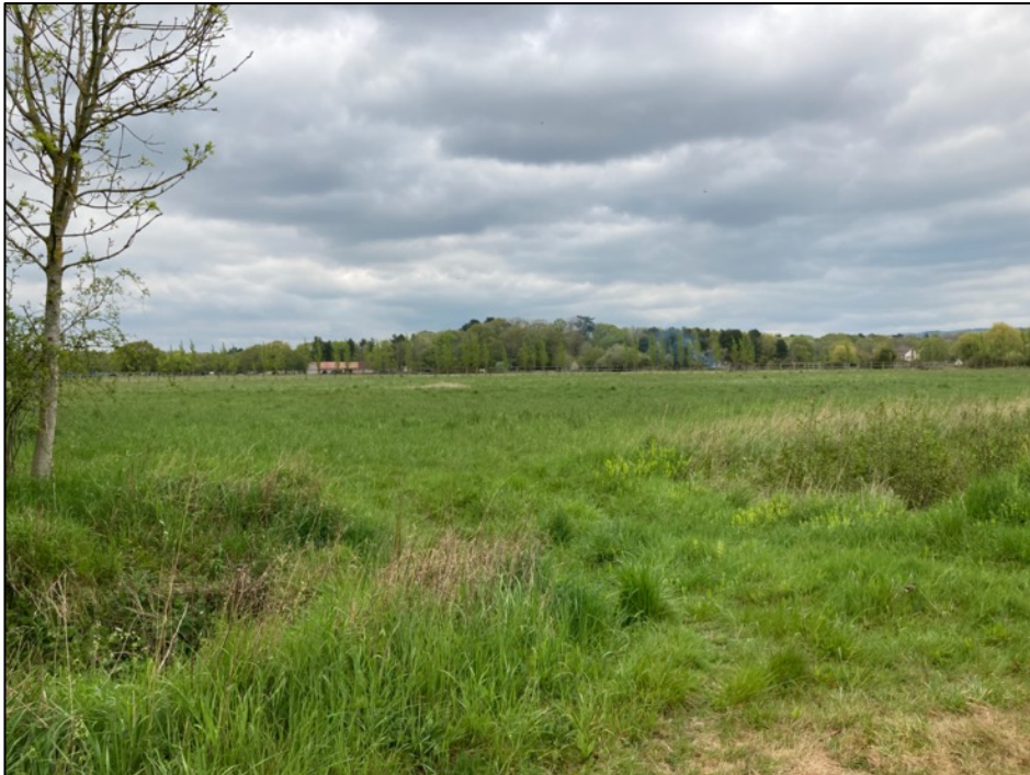
Photograph 1. Semi-improved grassland

common mouse-ear Cerastium fontanum , white dead-nettle Lamium album and cow parsley Anthriscus sylvestris .