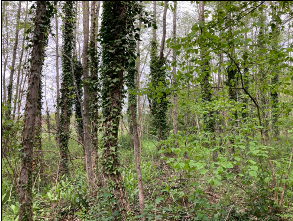
Photograph 2. Broadleaved plantation woodland