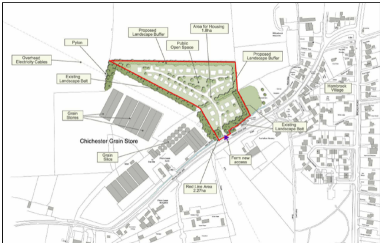
Figure 2. A preliminary layout plan for development at Land at Chichester Grain, Southbourne, reproduced courtesy of Henry Adams LLP.