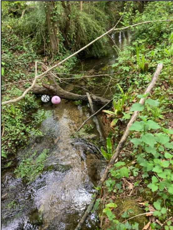
Photograph 6. Ham brook

Ham brook, designated as a chalk stream by the environment agency, lies to the south of the site, adjacent to the southern boundary and is approximately 1.5m wide. This falls within the Ham Brook Chalk Stream Wildlife Corridor proposed in the Southbourne Parish Neighbourhood Plan Review 2019-2037 Submission Plan (2021) (See Figure 3 for location).