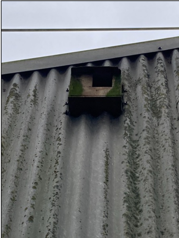
Photograph 7. Barn owl nest box