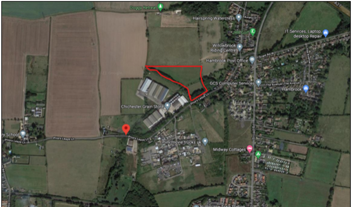
Figure 1. An aerial image showing the location of the site. The approximate site boundary is outlined in red.