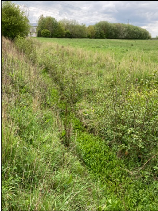
Photograph 4. Drainage ditch