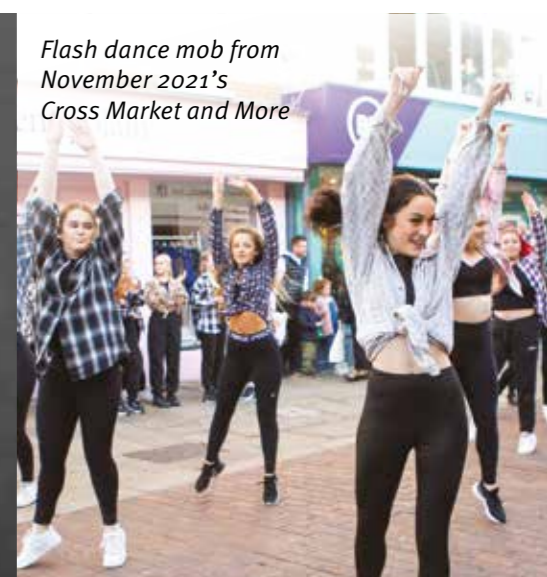
Flash dance mob from November 2021's Cross Market and More

To find out more, visit our events page at www.chichester.gov.uk/events or follow Chichester District Events and Markets Facebook page www.facebook.com/ChichesterDistrictEventsAndMarkets