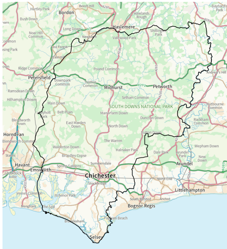
Figure 1: Chichester District