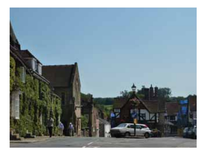
Even in the very centre of town, surrounding country is often visible on the skyline.