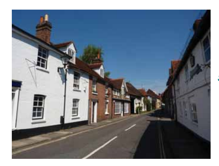
Sheep Lane – residential lane