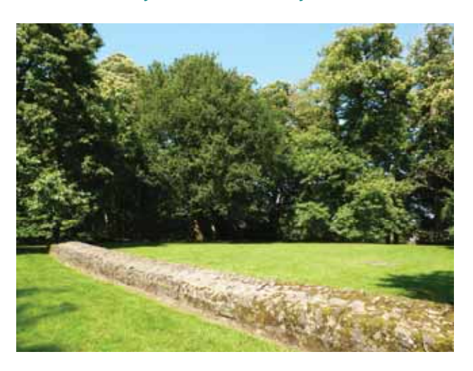
St Ann's Hill, with remains of the fortified manor.