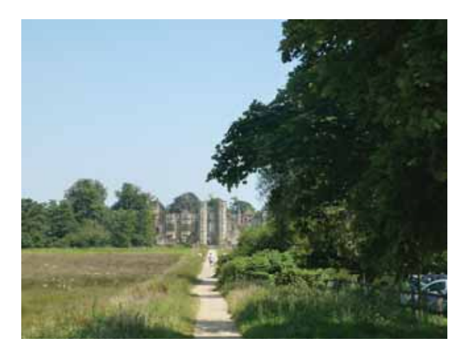
The Causeway toward Cowdray Ruins.

there is a blocked gateway and there may be potential to reopen this to provide an attractive path to St Ann's Hill. The cemetery is owned by Chichester District Council and could be enhanced through a regular maintenance regime.