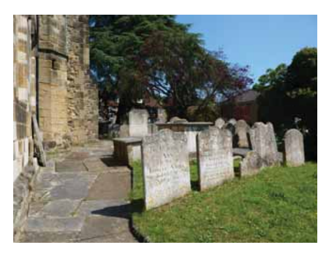
Churchyard of St Mary & St Denys.