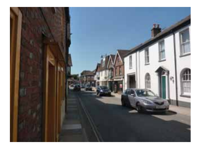
Rumbold's Hill is lined with good buildings but the environment is dominated by traffic.