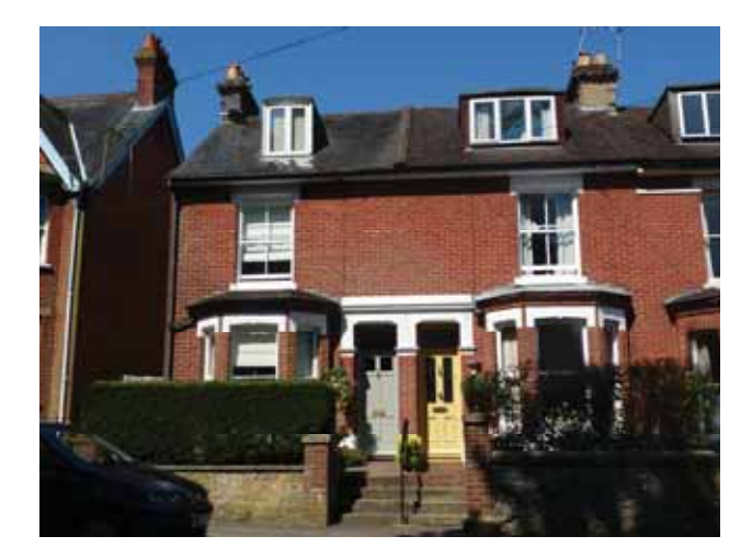
Good Victorian houses in Character Area 7.