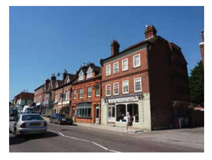
Shopfront design and signage is a critical component in the character of North Street.

Midhurst is particularly notable for its consistency of roof forms and for the use of hand made clay tiles. Several buildings have modern roof lights or dormers that are overdominant. The specific protection of these features, particularly on the unlisted buildings where the Council has less control, is important. An Article 4 Direction is one way of ensuring that minor changes to roofs and chimneys to unlisted buildings are brought under planning control.